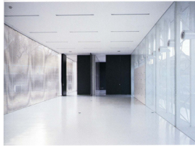
SANAA day care center for elders, yokohama