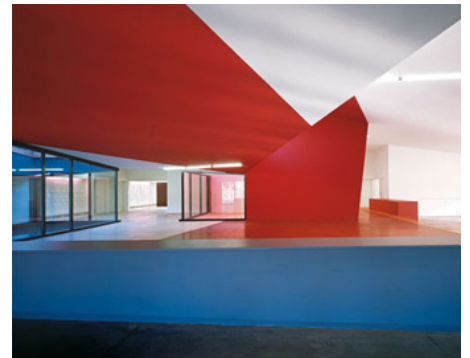
Dominique Coulon nursery school, marmoutier