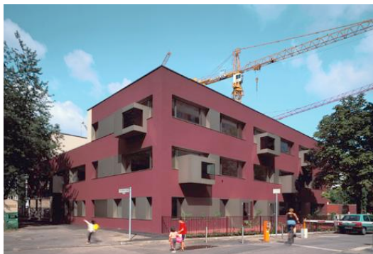
Staab Architekten kindergarden, berlin